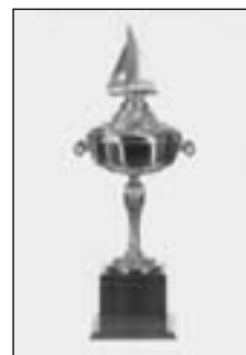
Frank Dair Trophy PHRF B

Midwinter 2012 T-Shirts are Available From Your Host Yacht Club