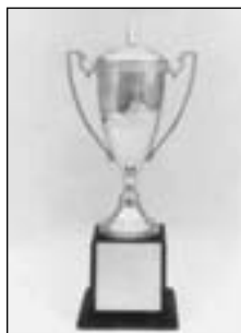
Harry Wills Trophy PHRF C

1st Warning Signal: 11:55 a.m. both days