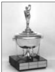
Jr. Naples Sabot Trophy Jr. Naples Sabot A