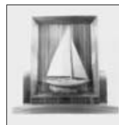
Kenneth E. Street Memorial PHRF A

Don't Be Disappointed - Order Your T-Shirt Today!