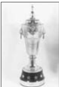
Frank Borzage Ñ Star