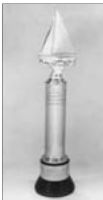
Midwinter Snipe Class Snipe