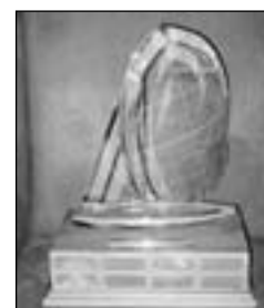
SBYRC Sport Boat Sport Boat

Don't Be Disappointed - Order Your T-Shirt Today!