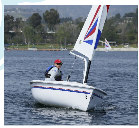
By Rod Simenz

Cornforth took only 8 seconds longer at 3 minutes 54 seconds for the best junior time. Congratulations to both of them.