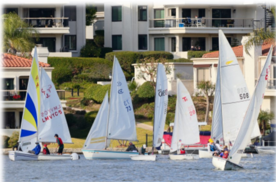
Fleet at C mark.

Tune Up Regatta and Inauguration photos courtesy of Club Photographer Donna Stegal