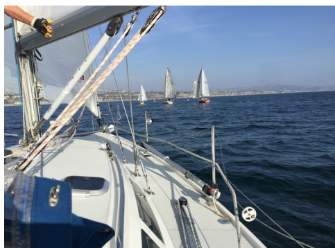
Approaching the finish line.