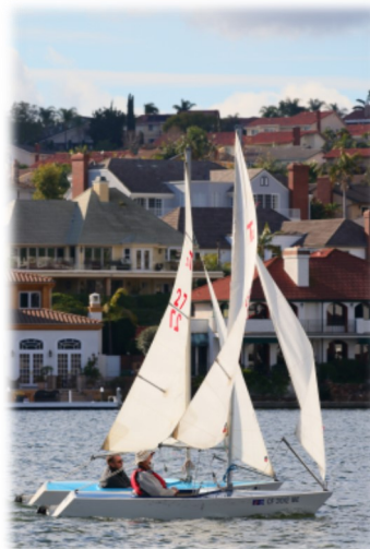
Neck & neck Twitchells