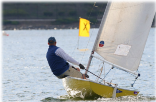
Guy approaching 'X'.