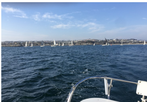
Watching the finish.