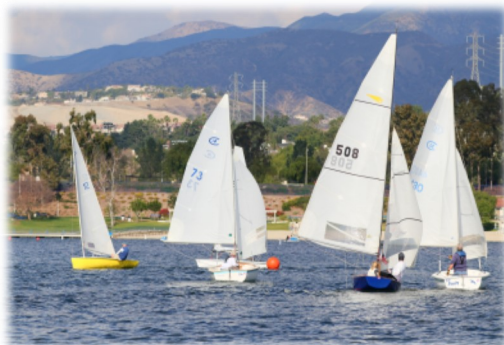
A & B fleets at the leeward mark.