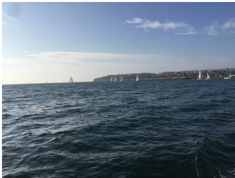
Dana Point and the returning fleet.