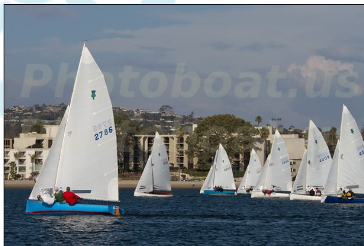
2786 Out Front!