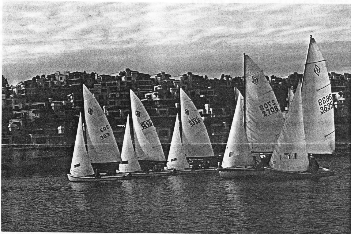
C-15 Invitational Regatta