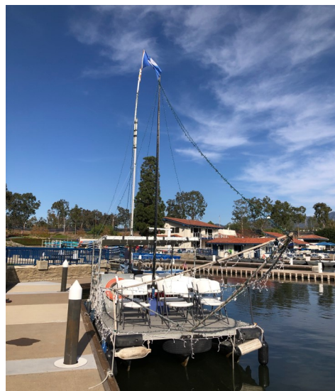
Done: awaiting her evening debut.

The accompanying photos document this process.