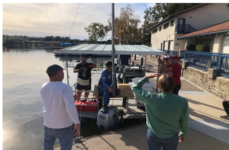
Aft mast assembly