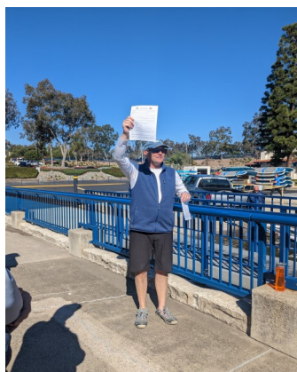
Race Chair leading Skipper's Meeting.