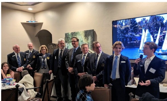
2022 Appointee recognition