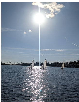
Afternoon sun, water, and dinghies.