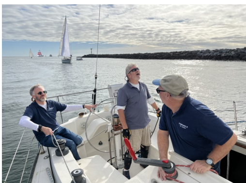
Downwind in the channel

Horse Feathers remained ahead of us to the harbor opening. Then a miracle happened: the Ericson turned wide around the mark while we slipped inside at the rounding. Now we had the lead, something we held onto throughout the return leg. Horse Feathers drove into a hole coming down the channel and the race was clearly ours. We finished first in fleet and possibly first over the line for all classes. To enhance our victory, a prior owner of Campaign 2 watched us finish first and cheered us on. An excellent day, indeed.