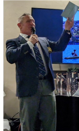
The Big Surprise