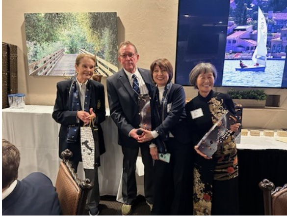
Race Committee recognition