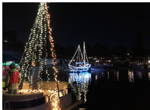
Just before the start.

And, while all of this is going on, an overflow party boat is commandeered to further accommodate LMVYC members who want to join the parade. That boat also receives festive lights to qualify it as a parade entry.