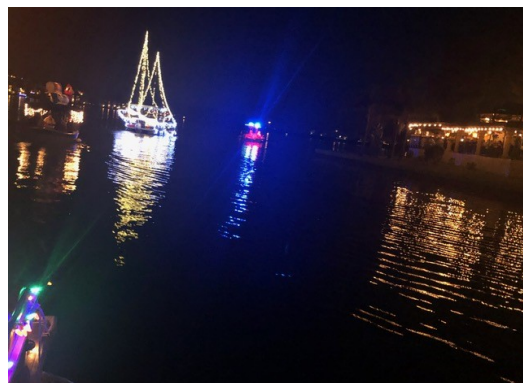
Lifeguards leading the schooner (taken from the LMVYC overflow boat).