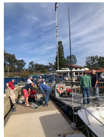
Sorting out lights

Every December, the LMVYC schooner leads the annual lake boat parade. The tallest and largest sailing vessel in the fleet, however, begins its journey in the morning as the humble biology barge. LMVYC volunteers arrive early on parade day to assemble Her Majesty. The first step is usually sorting out the many pieces to decide where they go. The second involves assembly, and the third is light installation. Finally, folded chairs are placed aboard for honored guests.