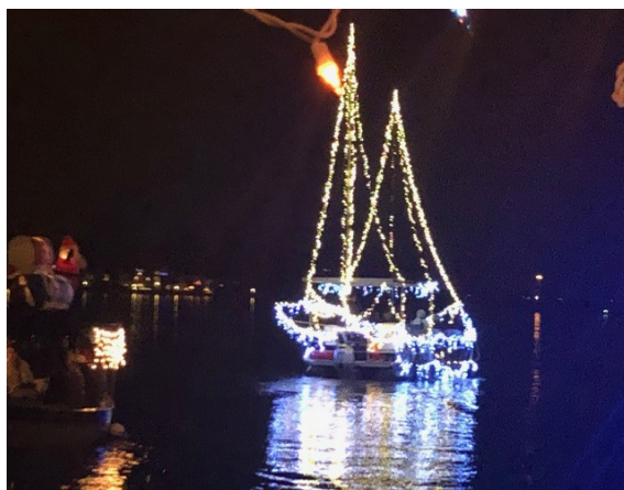
The schooner at 'sea'