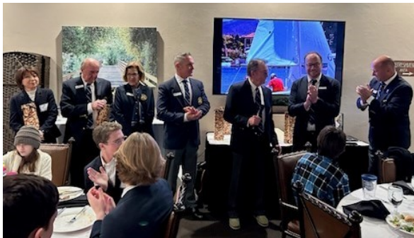
2022 Officer recognition