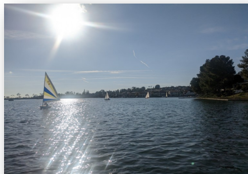
Downwind Expo . View from RC boat.

So, if you didn't sail in the Tune Up Regatta, give it some thought for next year. It may just make you a better sailor and give you that leg up on the competition. Have a great 2023 season and see you on the water.