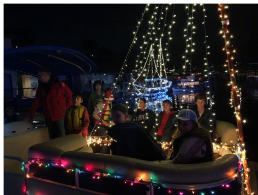
The Junior Boat