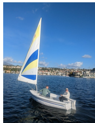
Expo passing RC downwind