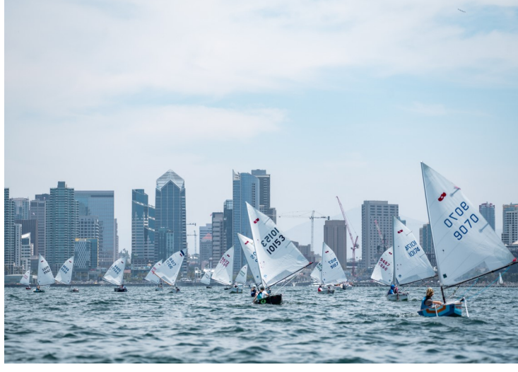
Fleet sailing past downtown San Diego

This was a much anticipated event for Sabot sailors that lived up to its reputation as an endurance test, a sightseeing cruise, a bucket list adventure, and a sailing challenge. San Diego YC is the host and they typically have 150 to 200 entries in A, B, C, and Senior classes. The skippers range in age from 8 to 80+. The race can take as long as three hours in the 8