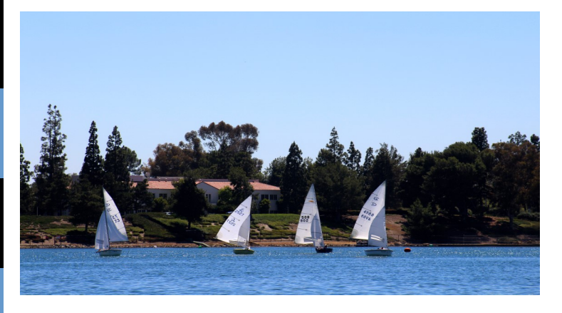
B fleet downwind