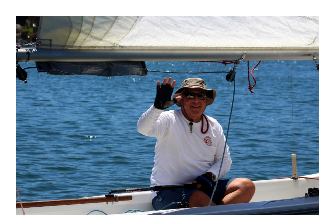
Spirit of the day

See you all out on the water and... starboard!!