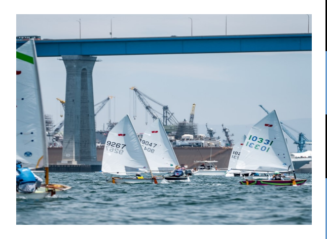
Tyler #9267 approaches Coronado Bridge

C2 and C3 fleet and 52 boats in Ted's Senior fleet. They had good wind's averaging 8.5 knots for their odyssey. It was a fast race with no encounters with war ships that would have required the Sabots to stop and hold their position until given an all clear (yes that actually happens). Ted's class started last and he finished ahead of 31 boats overall. Tyler's class