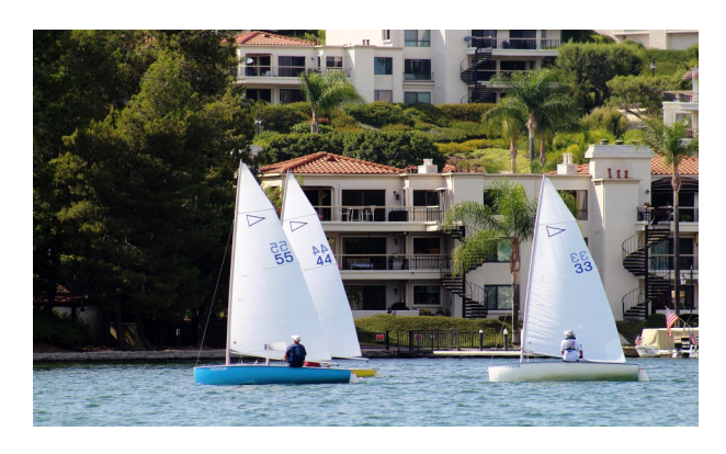
On their way