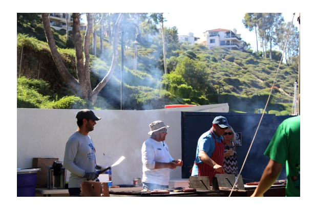
Cooks at work