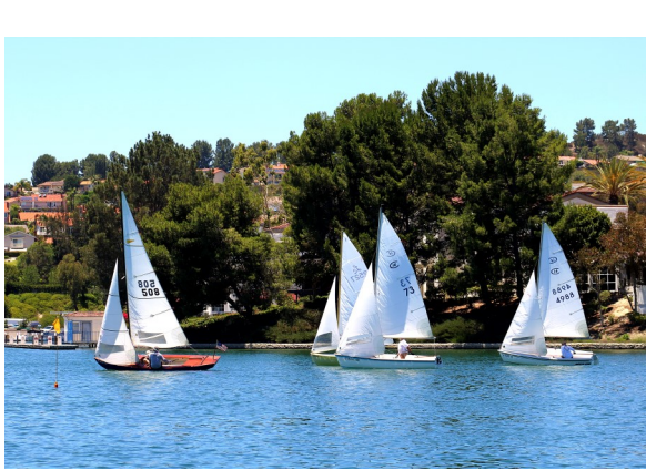
B Fleet start

In typical Lake Mission Viejo fashion, once sailors were briefed and headed up towards the start line, conditions actually improved and we had a nice 4-5 knots of breeze for much of the day. It was one of those days when the wind hole West of the start line played a big role,