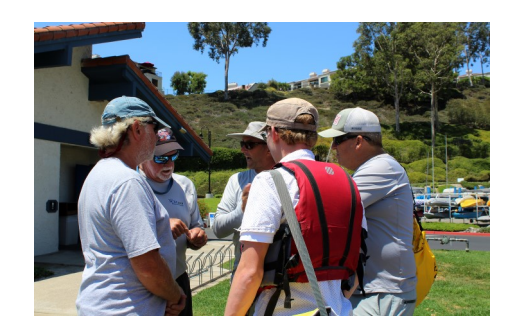
Grey Team strategizes