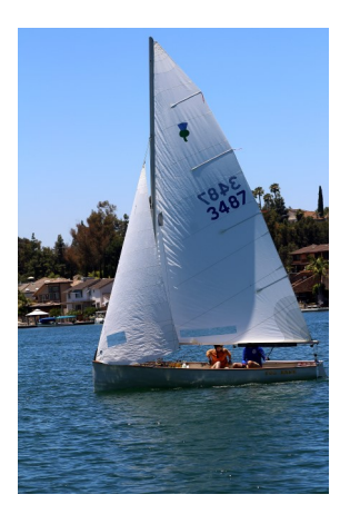
S/C Glackin & crew