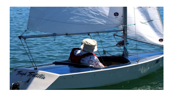
Rod showing his stern