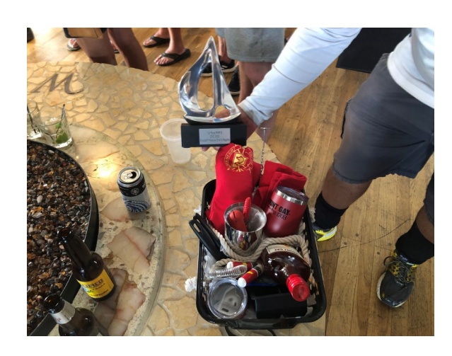
First place trophy and prizes