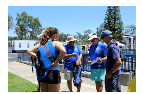
Blue Team huddle