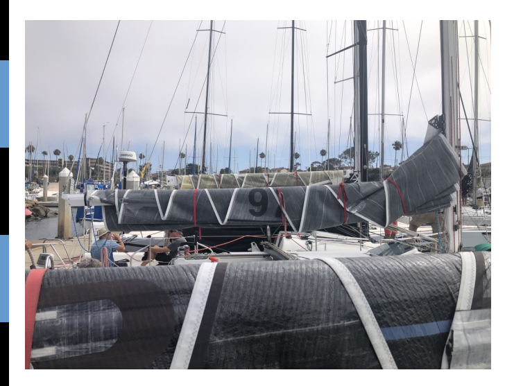
A portion of the fleet lined up

The start was great, we got clear air right away, and led the fleet to the windward mark, after about two tacks. At the mark I hoisted the chute and trimmed it to the next mark - we hit 10.4 knots! The 2nd race the Islander had a problem and dropped out, we were able to repeat the same on race 2. Which put us in 1<sup>st</sup> place.