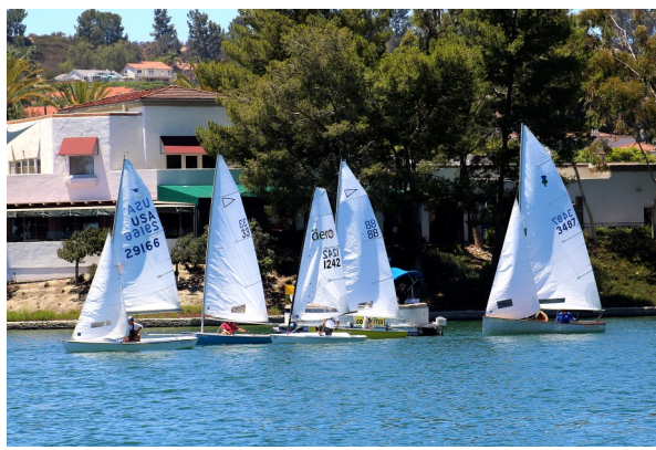
A Fleet start

After some relatively cool conditions through much of the Spring, summer hit with a bang for the Summer Regatta on June 26<sup>th</sup>. With temperatures forecast in the mid 90s and not a great deal of wind, it promised to be an absolute scorcher out on the water and racers were advised to bring along plenty of fluids.