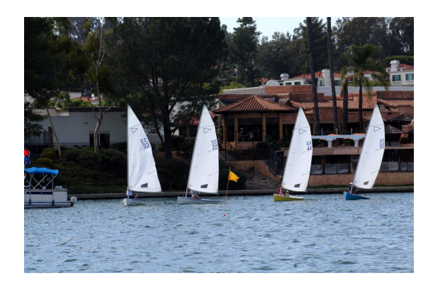
Balboas at the start