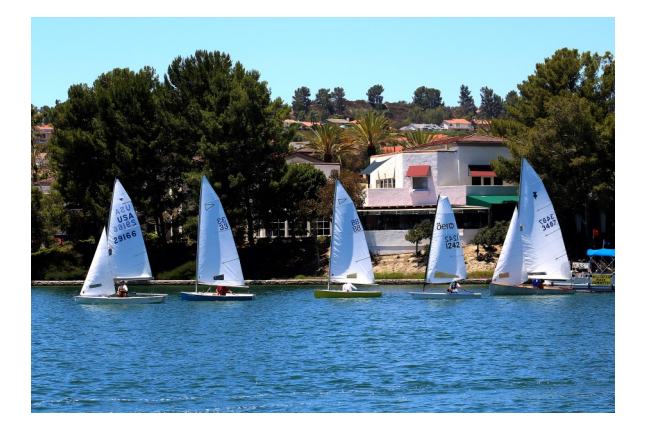
A Fleet in line

In C Fleet, it was a very close battle between Vivian Ikeda, Rod Simenz and Maverick Trudell. Maverick just did enough in Race 1 to earn victory by a slim margin over Vivian, with Rod some way behind. Vivian turned the tables in Race 2 and sailed away from everyone, with Rod just pipping Maverick on corrected time for second place. In the final race of the day, Rod led the way, overcoming both Vivian and Maverick, but it wasn't enough for the regatta win: final result was Vivian 1<sup>st</sup>, Rod 2<sup>nd</sup>, Maverick 3<sup>rd</sup>.