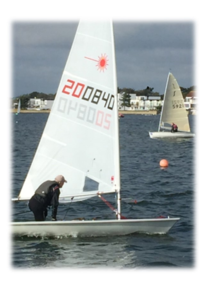
Laser action in Christchurch, U.K.

However once back in the whirl of airports on the return trip to the USA we found it exactly like the outward bound flight...EMPTY! How lucky we were (probably never happen again). It was just about worth the pre-hassle of all that paperwork we decided....just!!