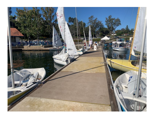
Boats awaiting their skippers

The final regatta of the year, the Turkey Regatta, was held on Sunday, November 14<sup>th</sup>, in the midst of a late-November heatwave. With temps in the 90s and only 2-3 knots of wind out on the course, some short courses were set to make sure we could get three good races in and get all the fleets back to the dock in time for the Annual General Meeting and Chili Cook-Off.