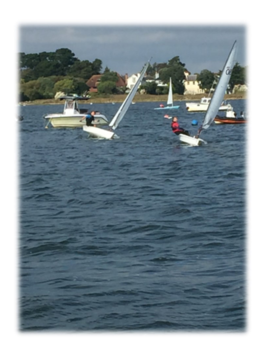
Close Hauled in Christchurch, U.K..