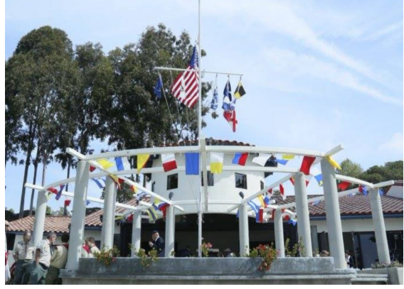
LMVYC Opening Day March 17th

Our club officially starts our season on March 17<sup>th</sup> with our opening day festivities and regatta. This year's regatta will not be part of the club championship series so members will have more time to enjoy the event. This is also Saint Patrick's Day and I'm sure that there may be some green beer to be found somewhere.